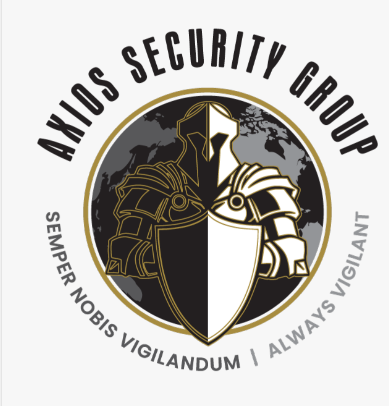
Axios Security Group Logo

Understanding Hurricane/Storm Looting: What Hurricanes Leave Behind: