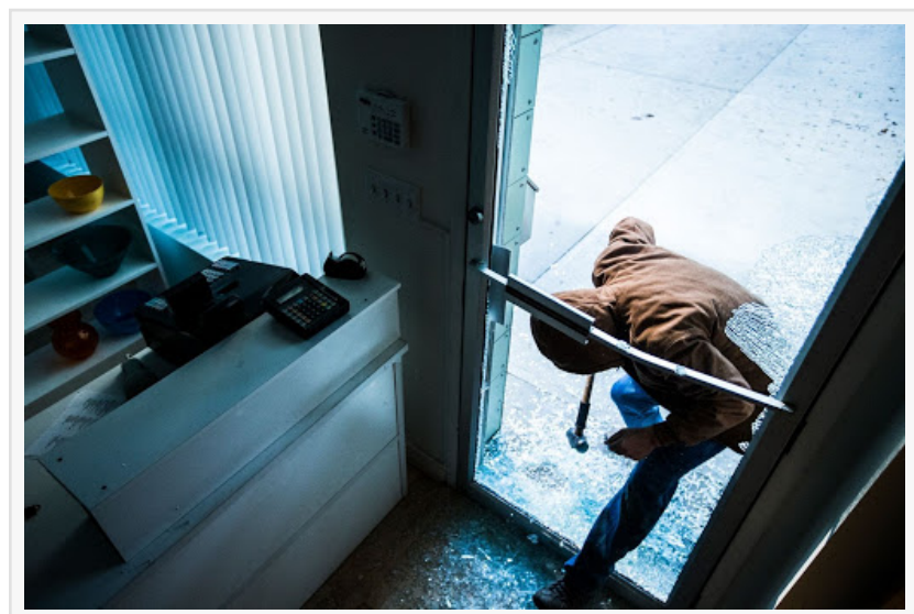
Breaking Into Businesses After A Storm

HOUSTON, TEXAS, UNITED STATES, July 11, 2024 /EINPresswire.com/ -- About 48 hours after <u>Tropical Storm</u> Beryl landed in Houston as a Category 1 hurricane, severe flooding confined residents indoors and kept them off the streets. Beryl brought wind gusts exceeding 90 mph and over 12 inches of rainfall to parts of the Houston metro area, resulting in significant flooding.