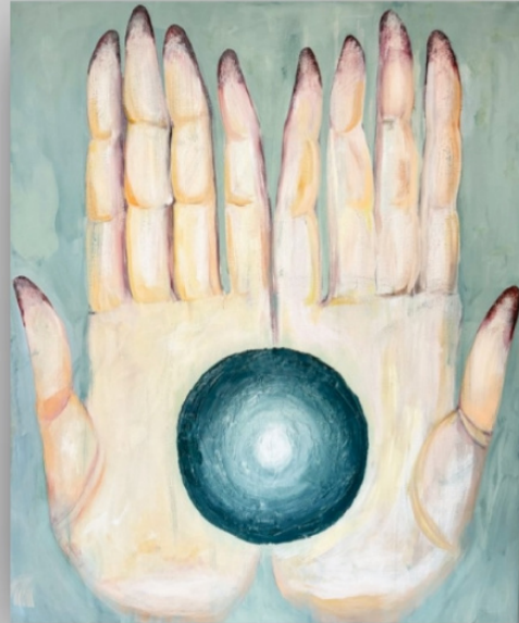
Melissa Aristizabal, "Suntoucher," Painting, Acrylic on canvas, neon acrylic, Acrylic paste., 110 x 90 x 3 cms