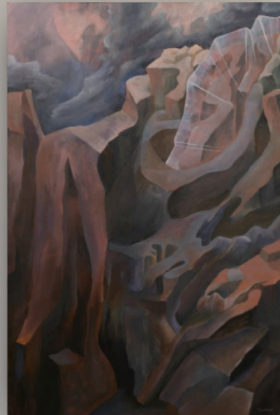
Tom Wynne, "A Mirror," Oil on Canvas, 50.8cm x 76.2cm