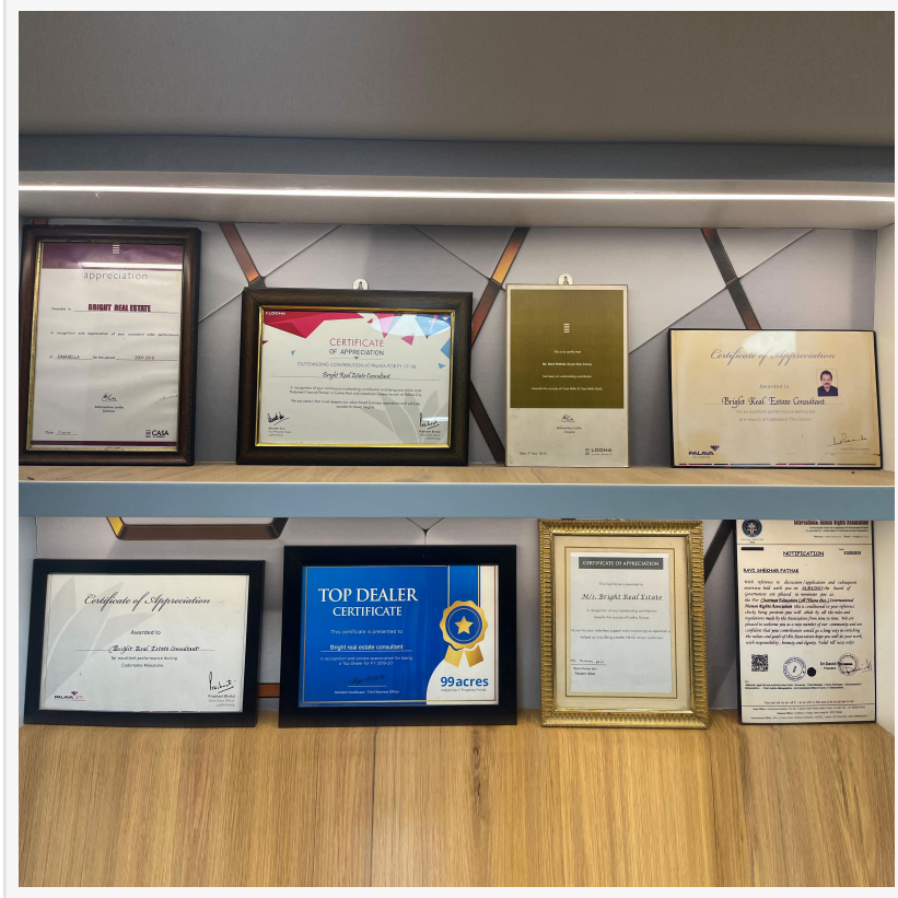
Bright Real Estate Consultant

At present, the real estate market of Palava is at a boom. It has immense opportunities for both investors and home buyers. Bright Real Estate Consultant has a deep understanding of the Palava market. They make