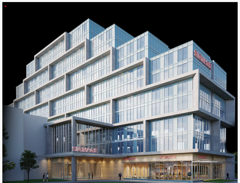
Zortech Canada new office building

“Our association with MethodHub consulting gives us more to offer our customers, leverage