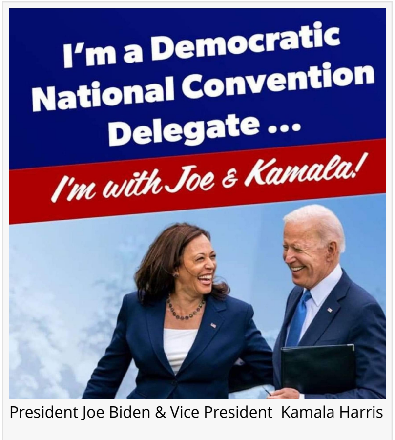
President Joe Biden & Vice President Kamala Harris

Furthermore, it is essential to recognize that leadership is not about a single speech or public statement. It is about making sound decisions, demonstrating integrity, and appointing qualified individuals to assist in governance. Joe Biden's cabinet members have not been accused or convicted of crimes, highlighting his commitment to ethical leadership.