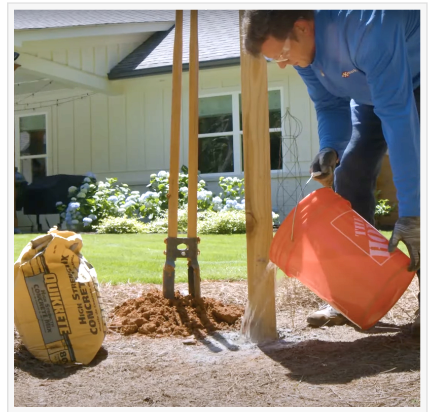
The posts that form the uprights of the living fence are set in concrete.

The local climate and soil conditions can also play a factor in determining the best plant species to use in a living fence. As a result, it's advisable to speak with a local nursery or garden center to get location-specific species recommendations.