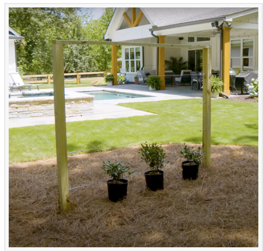
The completed living fence project.

With this in-mind, Exmark recently released a new video in its Done-In-A-Weekend Projects video series that shows homeowners how to build their own living fences. In addition to the "DIY Living Fence" video, the company also provides detailed build plans with tool and material lists, which are free to download on the Exmark Backyard Life site.