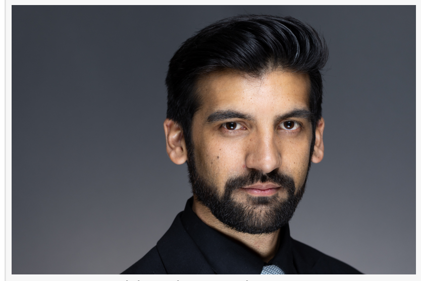
Las Vegas Headshot Photographer

One of the most significant improvements comes from the upgraded lighting equipment. Proper lighting is crucial in photography, as it can drastically affect the mood, tone, and overall quality of the image. The