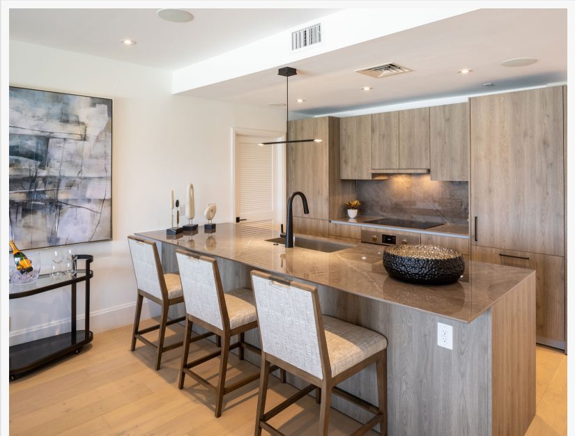
Houston high rise condos for sale

The Parklane's amenities cater to every lifestyle, including a resort-style pool and spa, a state-of-