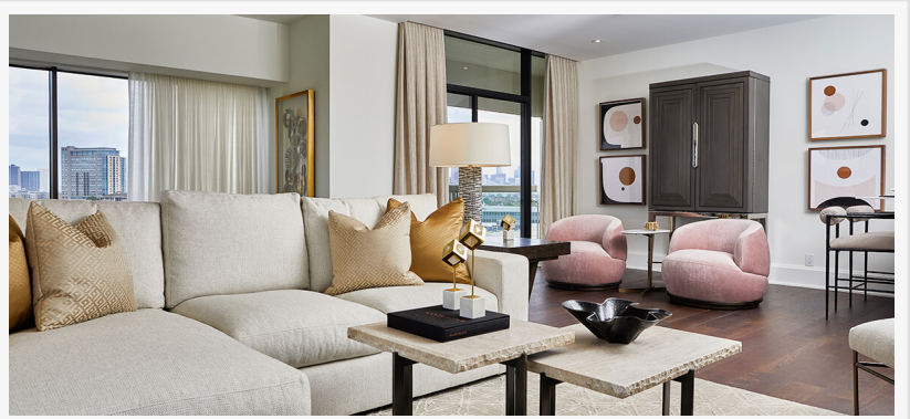
Museum District condos in Houston

The Parklane's stunning architecture and design create an urban oasis that is both peaceful and luxurious, with a sleek and modern exterior and meticulously landscaped grounds. For those seeking a new level of high-rise living, The Parklane's Museum District condos are the epitome of luxury and style in Houston.