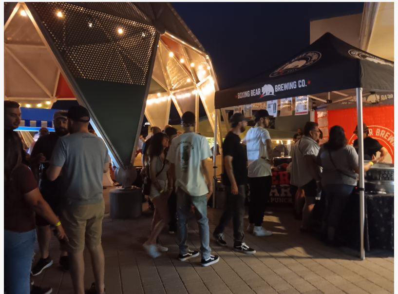
science of beer crowd