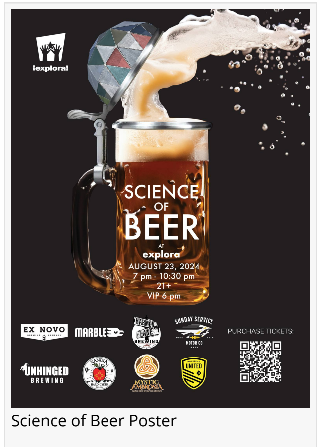
Science of Beer Poster

Plenty of curated Science of Beer games will be on hand for evening enjoyment as well. Visitors can learn how physics helps at gigantic Bucket Pong, explore probability in real-time at Dice Race,