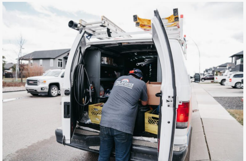
Electrical Repairs Saskatoon