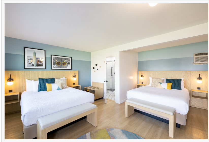
Tides hotel room after recent renovations

The recently remodeled Tides Oceanview Inn and Cottages is a home base as travelers explore the coast and the abundant activities the area offers. The Tides was previously owned by a local family from its beginning in 1949 until 2015 and has now been fully revitalized and updated by the Shorebirds Hotel Group after acquiring the property in 2022. Original owner, Gertrude, lived on-site in The Beach House with her husband from 1955 to 1998. With a premium location on the coastline overlooking the Pacific Ocean, the Inn still welcomes guests with friendly hospitality and authentic service. The Shorebirds Hotel Group has injected their beachy ambiance with modern amenities and comfort at the forefront of their design. The original motel section featuring 24 rooms has new accommodations with freshly renovated bathrooms, air conditioner/heater units, a cool turquoise retro mini fridge, and surf styled modern art in each room. The property also has five unique beach cottages and oceanfront studios with full kitchens and family game