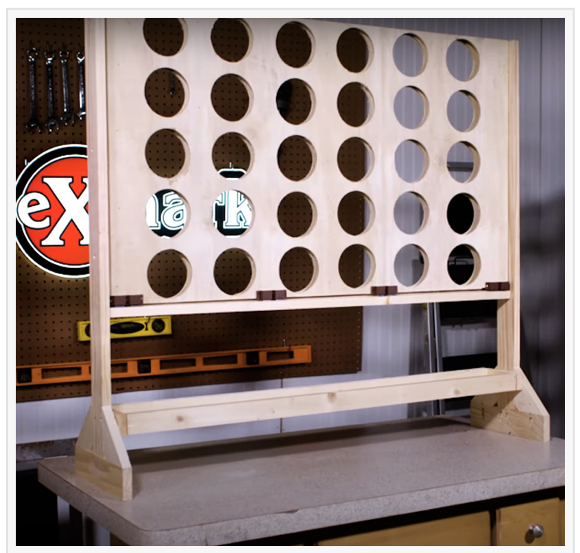
The completed game board is ready to paint or stain.

Matt Gersib Exmark + +1 402-314-2150 email us here Visit us on social media: Facebook