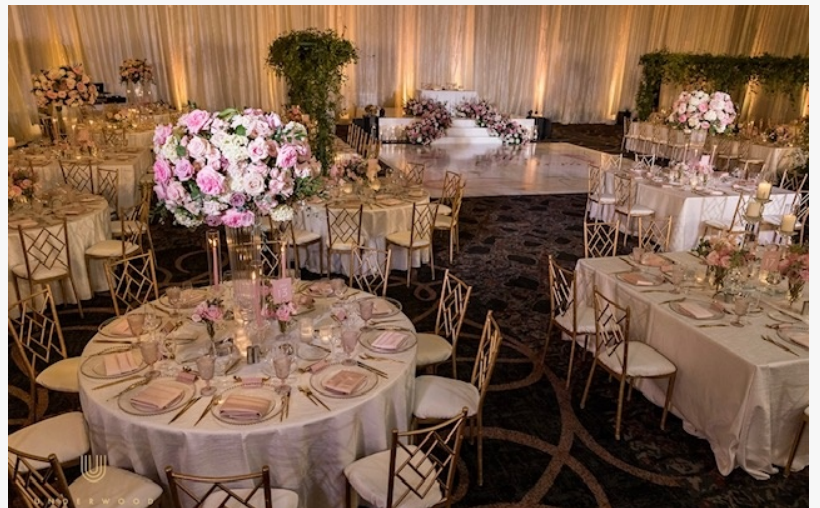
Wedding at The Hotel at the University of Maryland