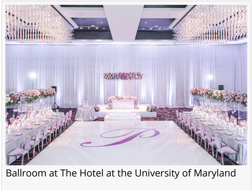
Ballroom at The Hotel at the University of Maryland

/EINPresswire.com/ -- The Hotel at the University of Maryland earned five-star ratings from dozens of wedding clients and a 'Fantastic' designation from WeddingWire, a trusted vendor directory affiliated with The Knot Worldwide Inc.