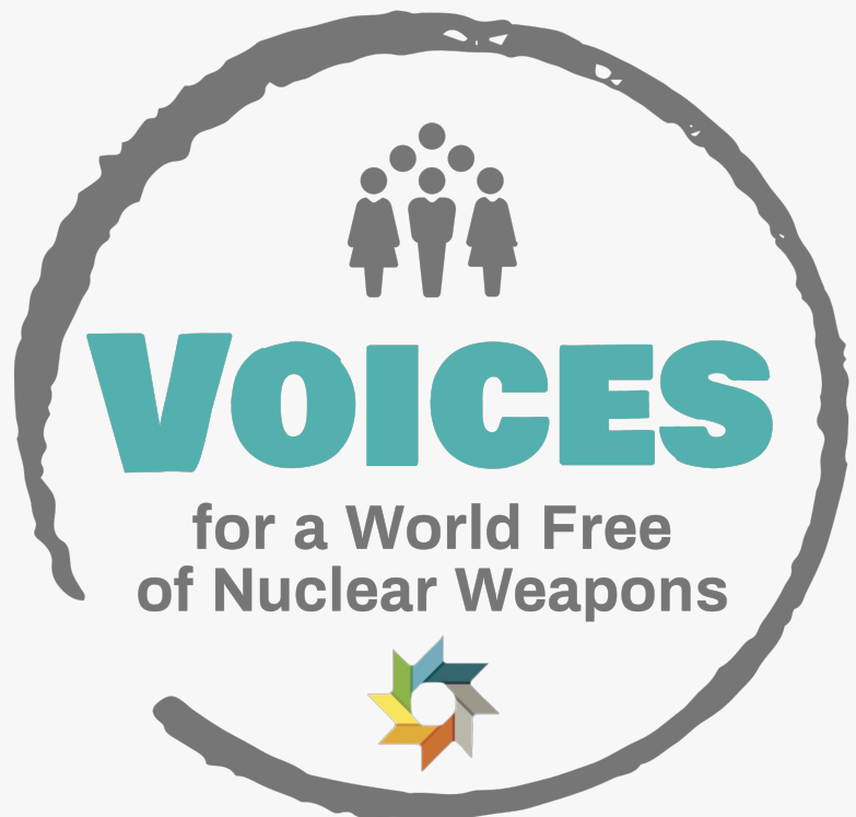
Voices for a World Free of Nuclear Weapons Logo