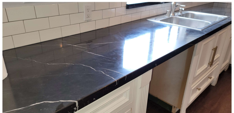
Sherman Oaks Stone Restoration | Granite Countertop