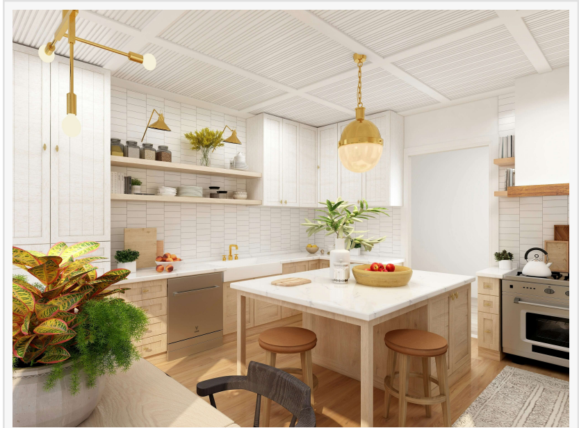
Kitchen Counter Restoration

/EINPresswire.com/ -- Sherman Oaks, a vibrant neighborhood known for its bustling business district and serene residential areas, is witnessing a remarkable transformation. The rise of specialized stone restoration services has significantly enhanced the aesthetic and structural integrity of local homes and businesses. The community is experiencing firsthand the benefits of professional stone restoration in Sherman Oaks , a service that not only rejuvenates the appearance of stone surfaces but also extends their longevity.