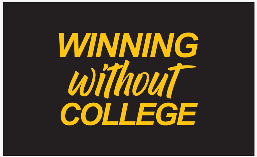
Winning Without College