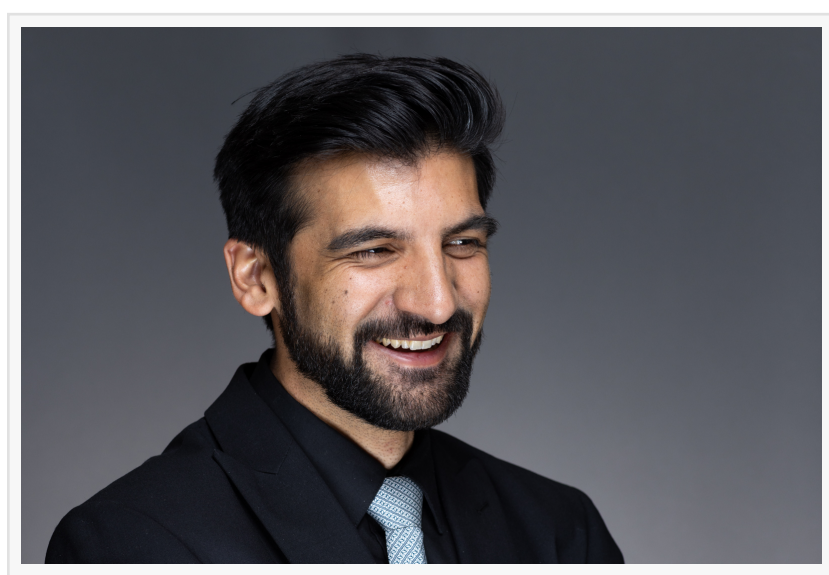
Las Vegas Convention Headshot Photographer