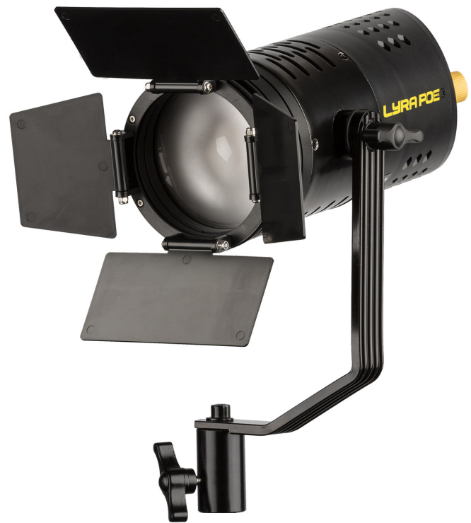
Lyra PoE 60W Fresnel LED Light