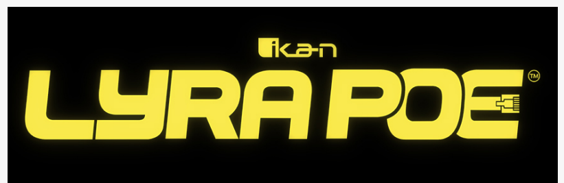
Ikan Lyra PoE LED Lights

Key Features of the Ikan LBF60-POE Fresnel Light: