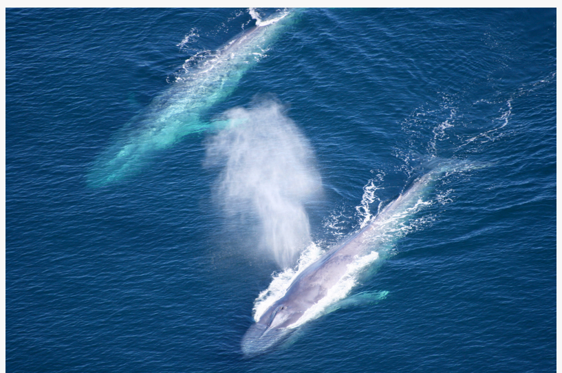
Two blue whales in Channel Islands National Marine Sanctuary

In 2023, cooperating shipping companies realized a 58% reduction in the risk of lethal ship strikes to whales, and an average decrease in underwater noise of 5.4 decibels per transit. Since the program launched in 2014, cooperating vessels have slowed down for more than 1,100,000 nautical miles, resulting in reductions of more than 150,000 metric tons of regional greenhouse