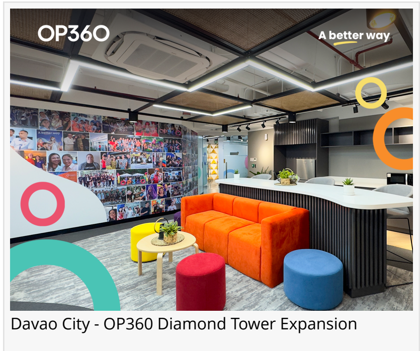
Davao City - OP360 Diamond Tower Expansion

Consistent with the other floors, the new floor showcases a modern industrial interior design that pays homage to regional icons brought to life by official fit-out partner Trends and Concepts Total Interior Solutions. The floor features a range of amenities designed to prioritize productivity, employee well-being, and client satisfaction: