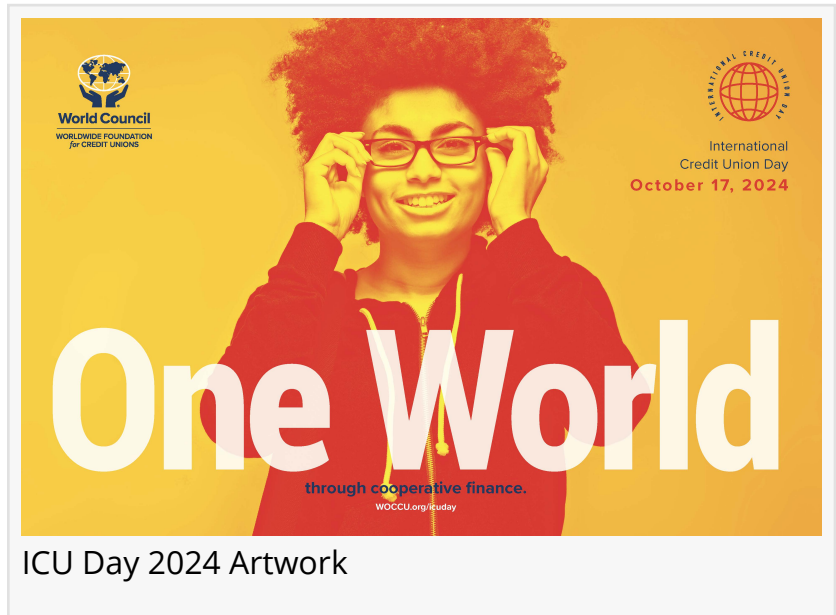
ICU Day 2024 Artwork

/EINPresswire.com/ -- World Council of Credit Unions (WOCCU) and Worldwide Foundation for Credit Unions (WFCU) are excited to announce "One World Through Cooperative Finance" as the theme for the 76th anniversary of International Credit Union (ICU) Day® on Thursday, October 17, 2024.