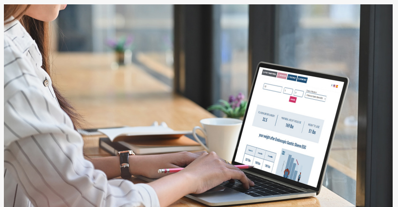
IBI Healthcare Institute_Weight Loss Calculator