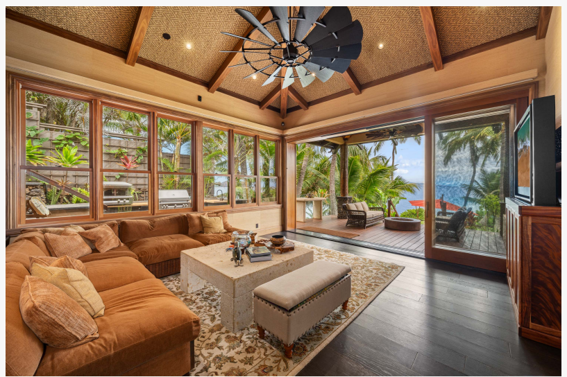
Seamless indoor and outdoor entertaining spaces with panoramic ocean views

Concierge Auctions is the world's best luxury real estate auction marketplace, with state-of-the-art digital marketing, property preview, and bidding platform. The firm matches sellers of one-of-a-kind homes with some of the most capable property connoisseurs on the planet. Sellers gain unmatched reach, speed, and certainty. Buyers receive curated opportunities. Agents earn their