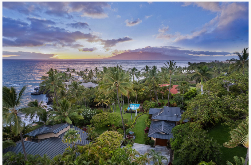
4610 Makena Road, Wailea-Makena, Hawaii

Nestled on the tranquil shores of Po'olenalena Beach in Wailea-Makena, 4610 Makena Road is a rare coastal gem spanning two oceanfront parcels, encompassing 1.43 acres of a verdant tropical haven. The estate boasts a staggering 148 feet of beachfront, elevated above shimmering white sands. Four impeccably designed buildings offer a combined 6,352 square feet of luxurious living space,