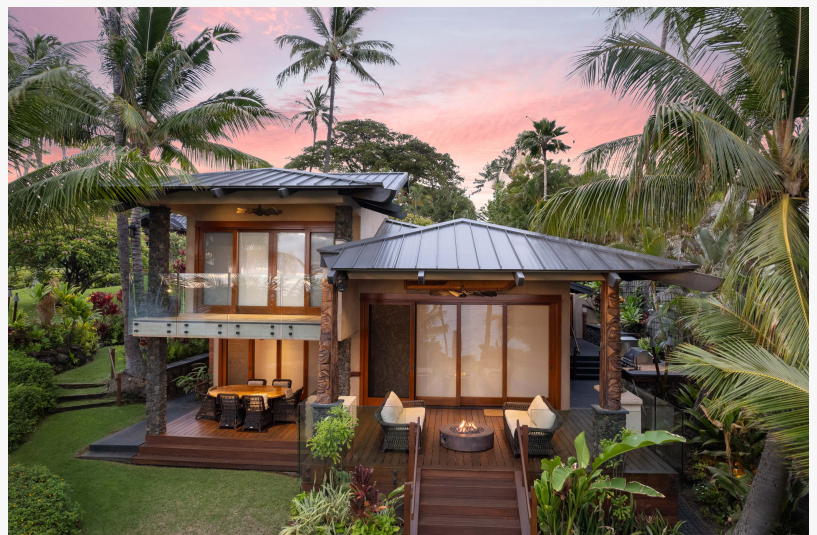
A private tropical haven with two gated entrances and private access