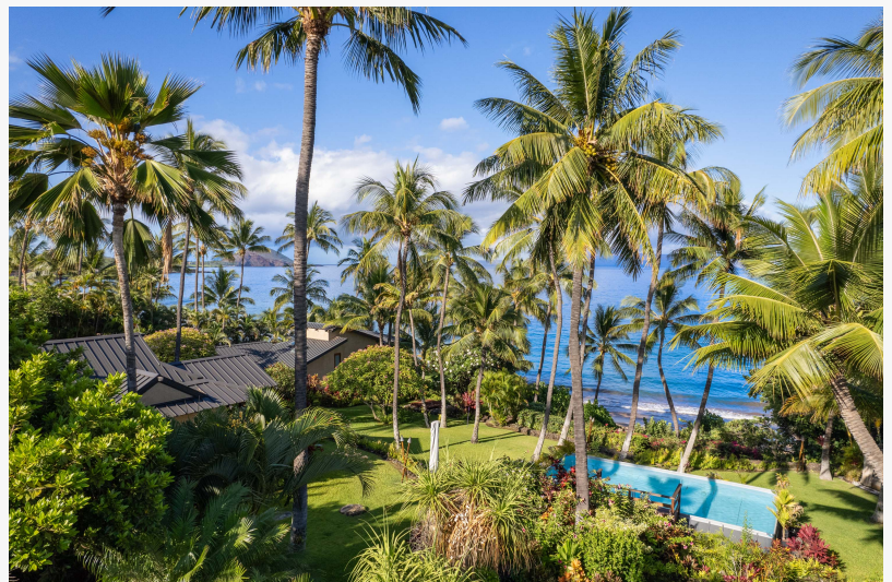
Four meticulously designed buildings with a combined seven bedrooms