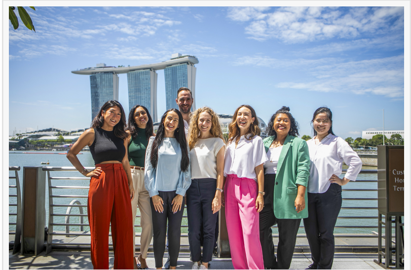
Sponsors in Tech team

This press release can be viewed online at: https://www.einpresswire.com/article/728147095