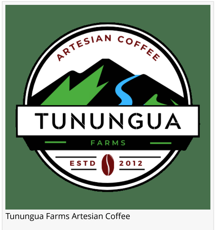
Tunungua Farms Artesian Coffee

**Explore a World of Flavors with Tunungua Farms**