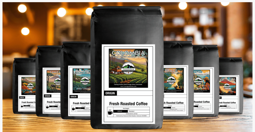
Tunungua Farms Single Origin Colombian Coffee

Tunungua Farms has built a reputation for delivering premium Single Origin Coffee by staying true to the traditional cultivation methods and unique environmental conditions that define each coffee's origin. With the launch of its Colombian Coffee, Tunungua Farms continues to celebrate the art of