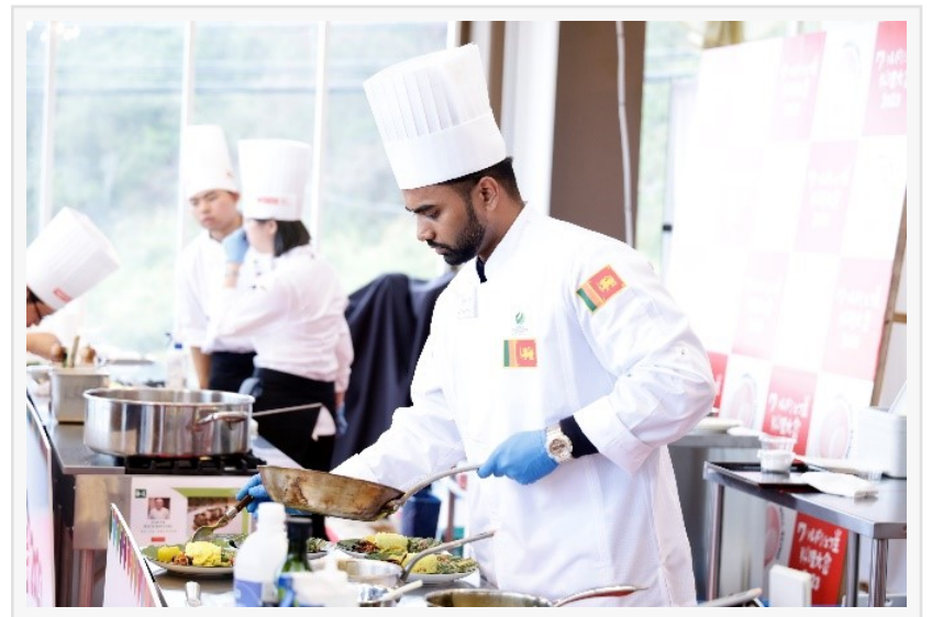
International cooking competition "World King of Chefs Summit"

Byron Russel Pasona Group Inc. +81 70-1267-1613 email us here