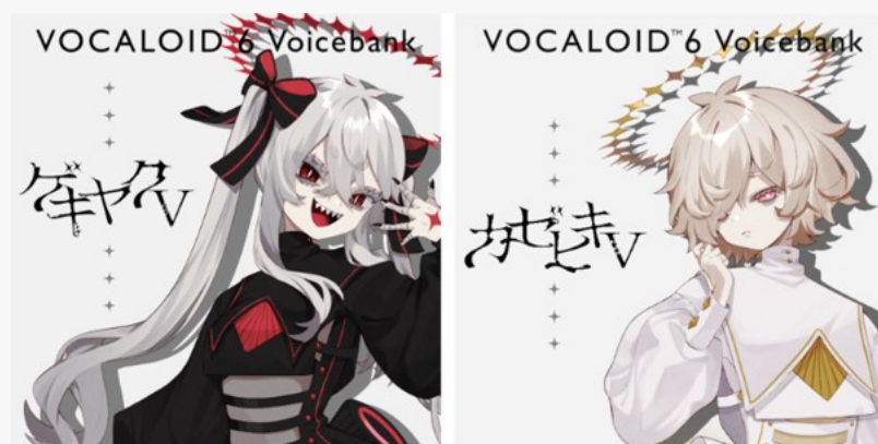
GekiyakuV, KazehikiV (Artwork: Kurukurusuuzi, Logo: Yuiru)