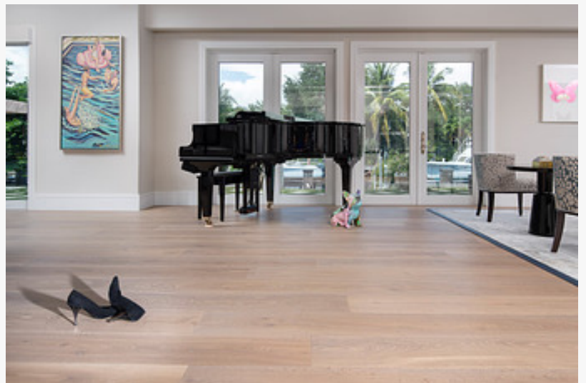
Fort Lauderdale Waterfront estate. Flooring by European Flooring of Fort Lauderdale