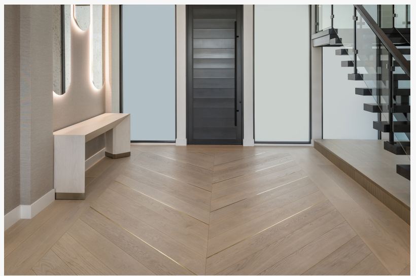
Amantea Trecento G1 Chevron by European Flooring of Miami

Aiello and Rahl’s observations are backed up by insights and trend reports from leading design