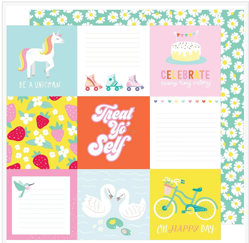
BANANA SEAT - 12X12 DOUBLE-SIDED PATTERNED PAPER - DEAR LIZZY

The relationship with customers is at the heart of 12x12 CARDSTOCK SHOP's success. By consistently offering high-quality products and exceptional service, the brand has cultivated a