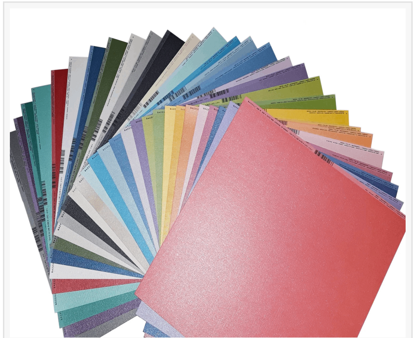
BLING COMPLETE VARIETY PACK - 12X12 MICA-COATED CARDSTOCK - BAZZILL

12x12Cardstock Celebrates Its 500,000th Order with Special Customer Giveaways