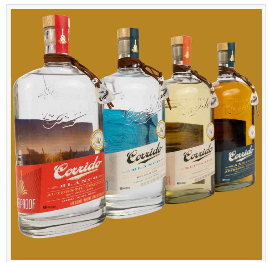
Tequila Corrido Overproof, Blanco, Reposado, Añejo

The Tequila Corrido journey to the bars, restaurants, and retailers of Michigan and Massachusetts (and delivery across the majority of the country) begins in the highlands of Jalisco, Mexico. This premium, additive-