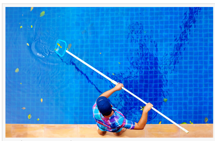
Pool Service Marketing