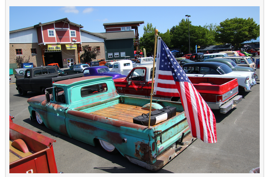
Join the hot rodding fun as Goodguys returns to Puyallup, Washington, July 26-28!

Goodguys returns to Washington state for the 36th Griot's Garage Pacific Northwest Nationals presented by Wicked Fabrication in Puyallup, July 26-28!