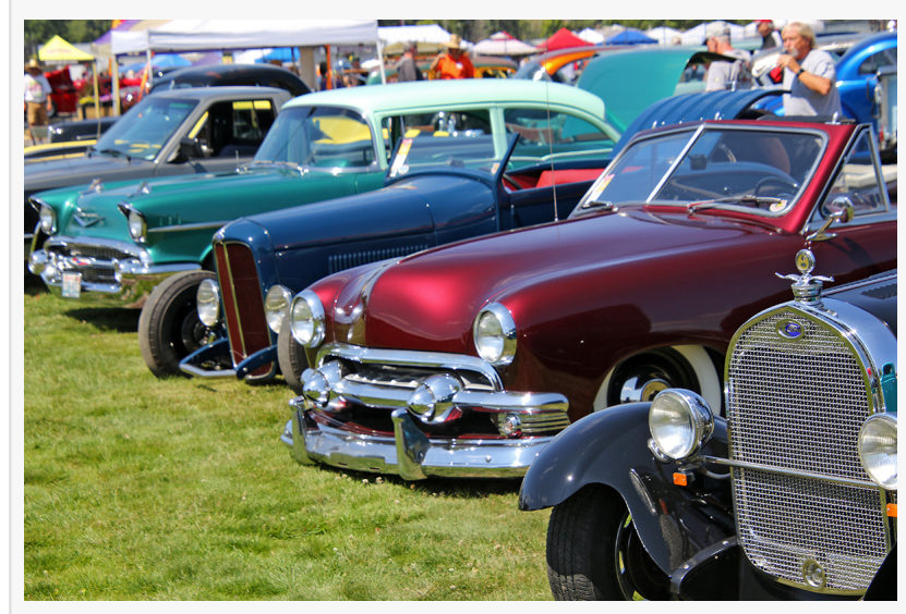
You'll see classic cars of all generations during the Goodguys 36th Pacific Northwest Nationals.

can get up close to watch the steady hand of pinstripers and artists at the Brush Bash and maybe have your phone case striped for a custom souvenir. If you're looking for parts, stroll through the Cars 4-Sale Corral, the Swap Meet or Manufacture's Midway to find the best parts for your project car.