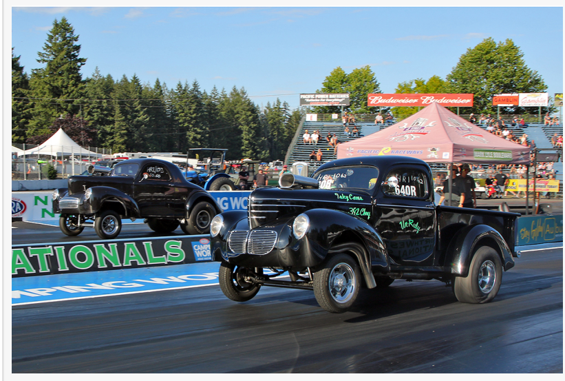
Don't miss the exciting nostalgic drag racing on Friday night at near-by Pacific Raceways!

The family friendly event features a Family Fun Zone with games and crafts including a free Model Car Take-and-Make courtesy of Autoworld complemented with a model car display. In the same exhibit hall you