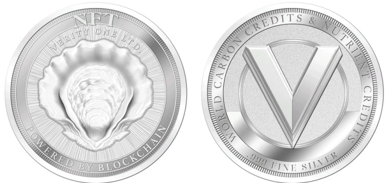
Verity One Token FB