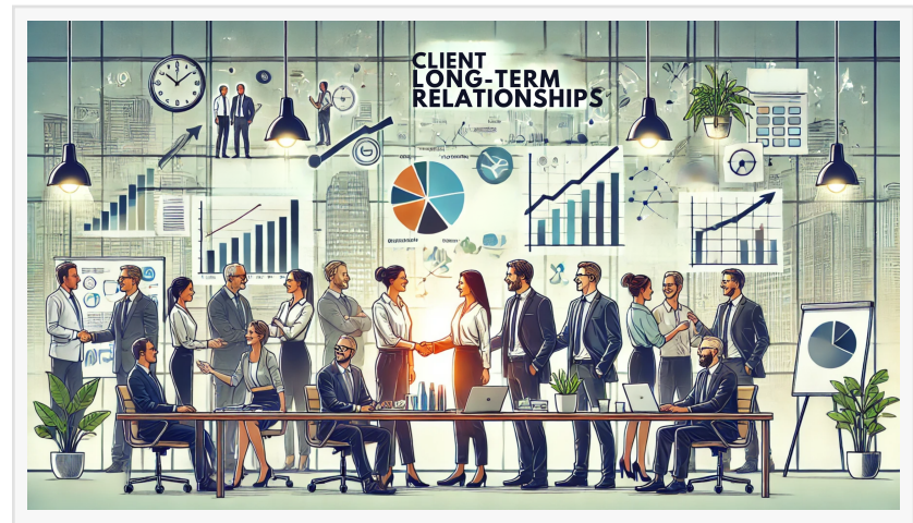
Maje long term clients

MAJE Investments excels in crafting personalized financial strategies that cater to each client's requirements. By thoroughly assessing their clients' financial landscapes and objectives, they can devise innovative solutions that align perfectly with their goals. This bespoke approach ensures that clients receive financial instruments and services designed to meet their needs.