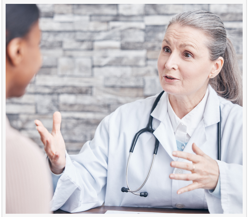
Figure 3 Physician Talking with a Patient About Using Medications to Threat Opioid Use Disorder

disorder, such as buprenorphine and methadone." This training is designed to provide education and support to healthcare professionals who have patients who can benefit from existing medications. It equips them with the knowledge and skills they need to effectively treat the disorder, as well as to help patients get access to the appropriate resources and care.