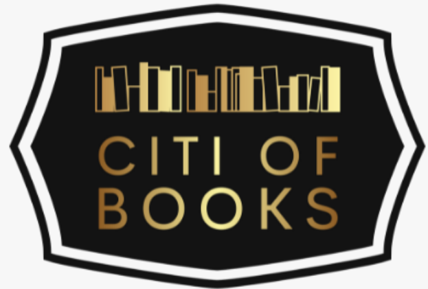
Citi of Books

God has given us everything we need to know for salvation and eternal life. When our eyes see our hands, voice, and feet doing the work of our gifts from God, the door of our soul flies open, and love steps forth. If we conform our lives to the principles and teachings of Jesus and let his teachings guide us and live through us in our daily lives, in return, we will become a ray of beauty, bearing resemblance to Jesus himself.□