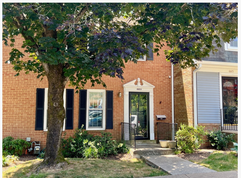
6613 McLean Ct., McLean, VA 22101 (Fairfax County)