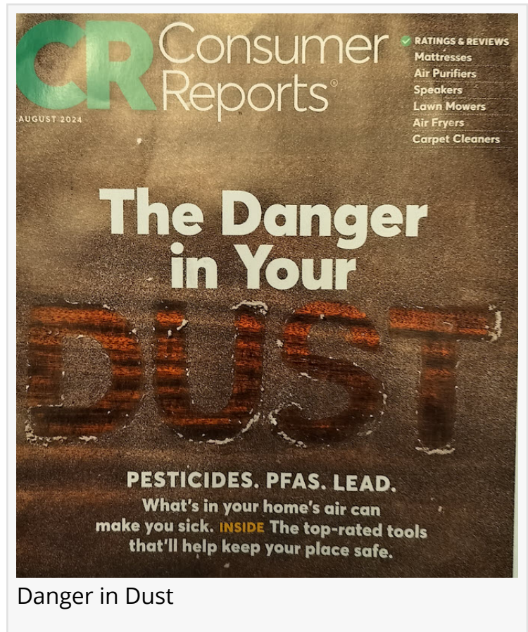
Danger in Dust

Key points from Danielle Mortimer's expert analysis include: