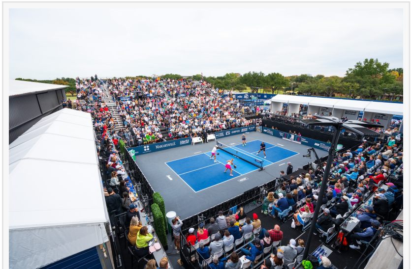
The 2023 event welcomed 3,500 players and 50,000 fans to Pickleball Boulevard.

UPA Strategic Advisor, former CEO of the Women's Tennis Association (WTA), and former President of UTR Sports. "We are extremely discerning in selecting partners for these joint ventures, and continue to have conversations with interested organizations. The expertise offered by our operational partners is unmatched in their regions and, combined with the proven business model and brand recognition the PPA Tour and MLP provide, will elevate this new series immediately."