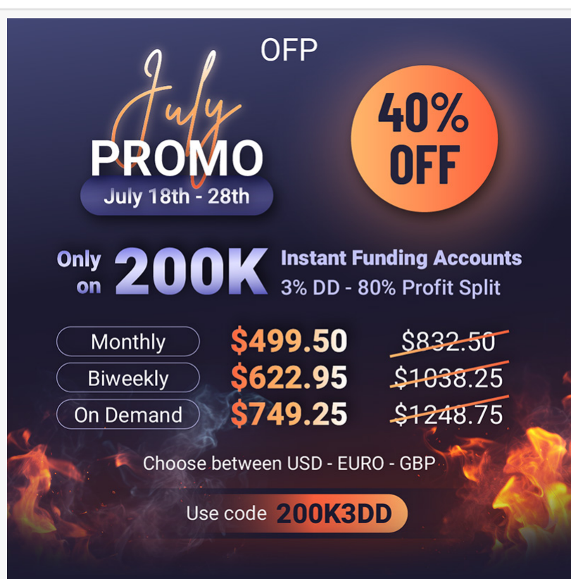
OFP Funding's 40% Summer Promo

Traders who take advantage of this promotion will gain immediate access to a $200,000 trading account , allowing them to leverage significant capital without the usual upfront costs or challenges to pass. With a manageable 3% daily drawdown, traders can effectively manage risk while focusing on maximizing their profits.