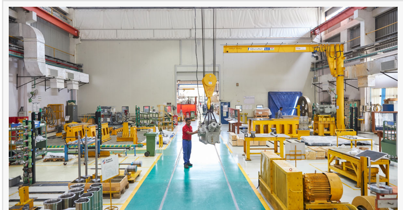
Burckhardt Compression India Workshop with SHP

fiscal year. These major orders, involving 82 Standard High-Pressure Compressors, are underpinning the company's growth in sustainable energy solutions.