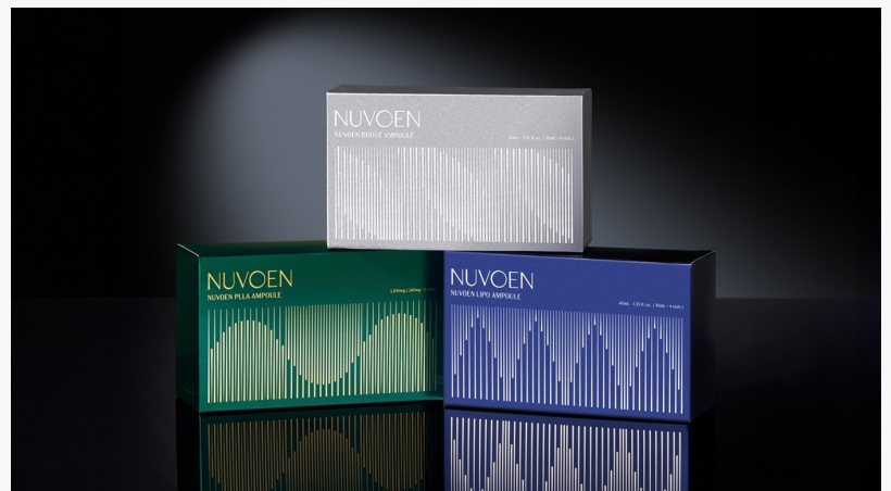
New Clinic-Use Ampoule 'Nuvoen'