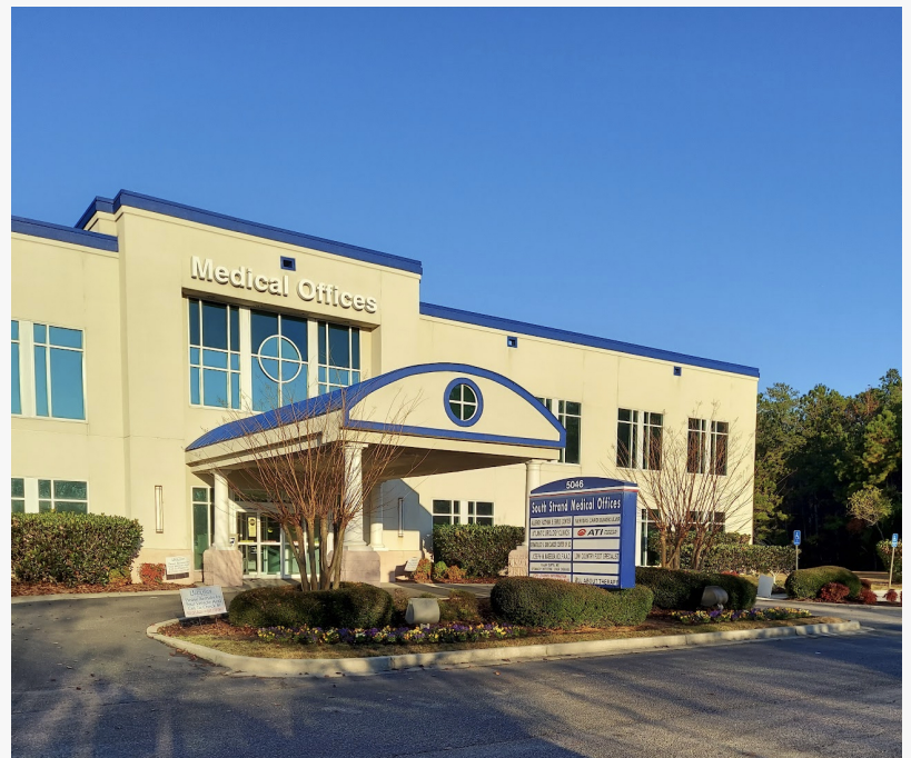
Waccamaw Dermatology South Strand Office