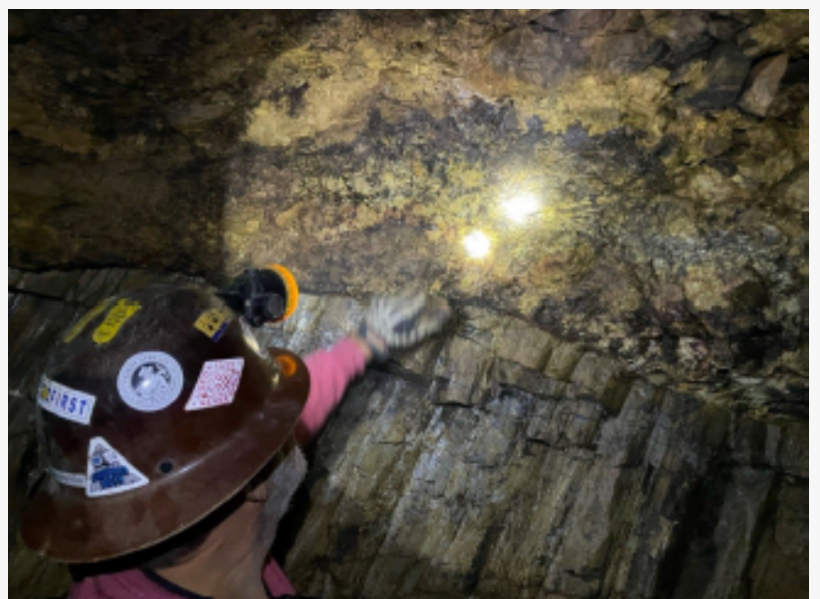
Mt. Vernon Underground Gold Mineralization