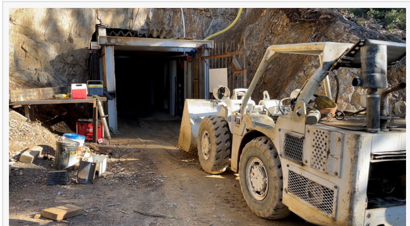
Mt. Vernon Mine Portal

BISHOP, CALIFORNIA, USA, July 18, 2024 /EINPresswire.com/ -- North Bay Resources Acquires Mt. Vernon Gold Mine, Sierra County, California, with Assays up to 4.8 oz. Au per Ton July 18, 2024 – Bishop, CA – North Bay Resources Inc. (the “Company” or “North Bay”) (OTC: NBRI) is pleased to announce it has entered into an agreement (the “Agreement”) with a private arms-length Company to acquire a 100% interest in the Mt. Vernon Mine located in Sierra County, California. The Mt. Vernon Mine is a largely undeveloped deposit, proximate to some of the richest past producing gold mines in North America. Mt. Vernon is a permitted underground mine with modern portal, tunnel, ventilation, power, and equipment (see Picture 1). The Company plans to commence test mining immediately and initial