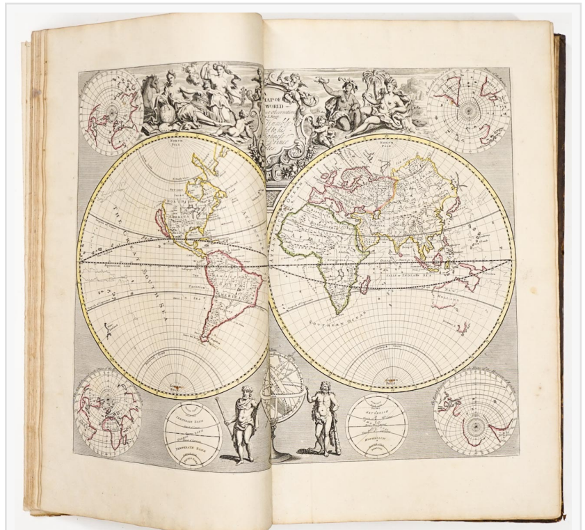
Copy of A New General Atlas, Containing a Geographical and Historical Account of All the Empires, Kingdoms and Other Dominions of the World, by John Senex, published in London in 1721 (est. $12,000-$18,000).

In all, nearly 1,000 lots will come up for bid. The books will feature subjects that include