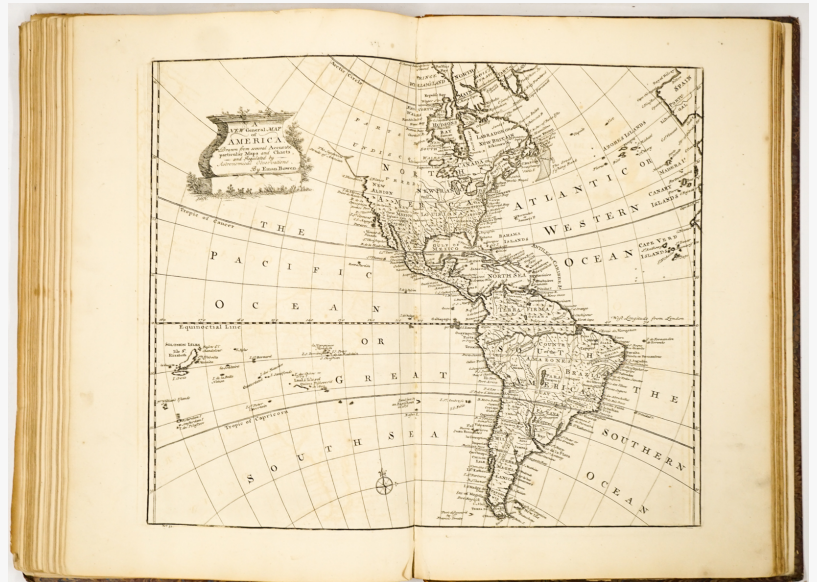
Copy of A Complete Atlas, or A Distinct View of the Known World by Emanuel Bowen, with 68 engraved maps including 47 double-page maps, published in 1752 (est. 4,000-$6,000).