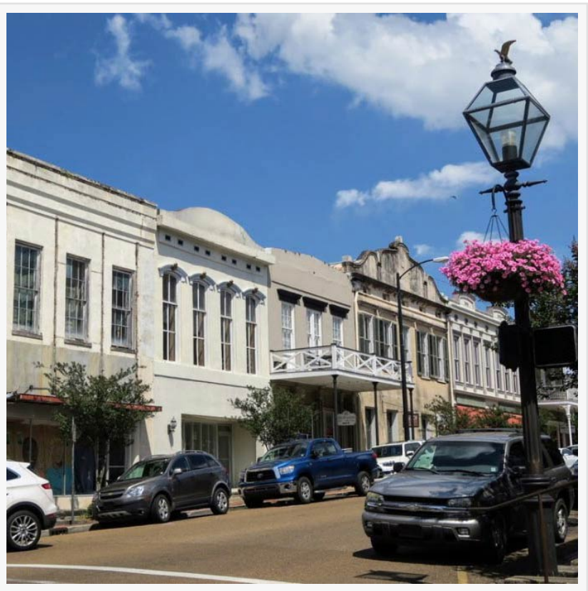
A view of Main Street in Natchez, Mississippi

To quality for National Accreditation status—Main Street America's top designation tier—communities must demonstrate a proven track record of achieving outcomes in alignment with the Main Street Approach™, as represented in their local strategic work plans, and exceptional performance in six areas: broad-based community commitment to revitalization; inclusive leadership and organizational capacity; diversified funding and sustainable program operations; strategy-driven programming; preservation-based