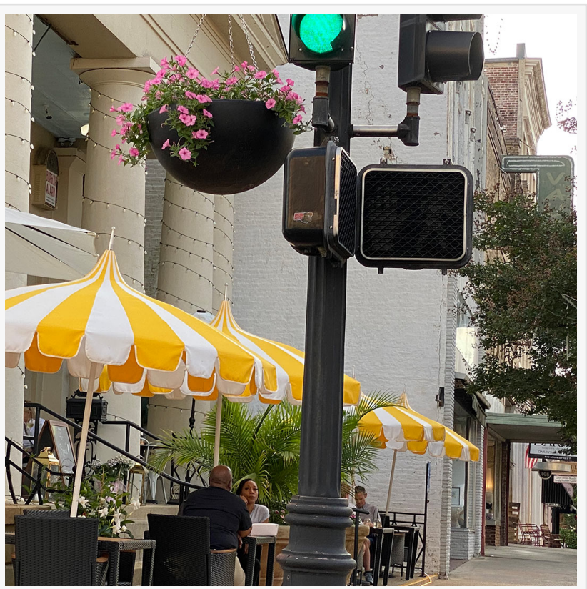
A stoplight at Main and Commerce Streets in Downtown Natchez. Patrons can be seen at the outside dining area with yellow & white umbrellas at the restaurant, Frankie's On Main.

Each year, Main Street America and the respective state Main Street organization announce the list of Nationally Accredited programs to recognize their exceptional commitment to preservation-based economic development and community revitalization through the Main Street Approach<sup>™</sup>. "Receiving National Main Street Accreditation is a