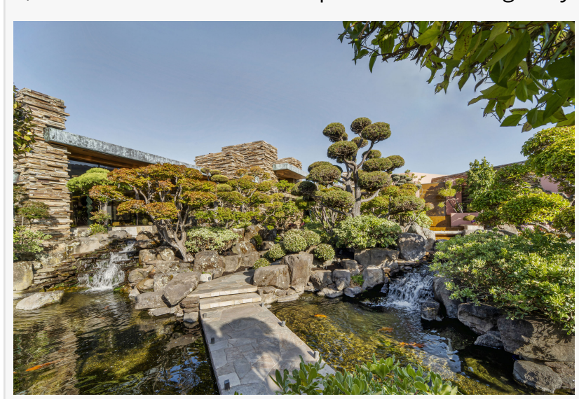
Terraced Japanese landscaping designed by Kimio Kimura