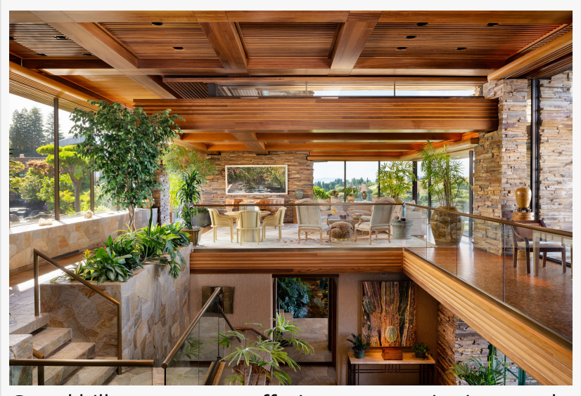
Gated hilltop property offering panoramic views and privacy

largest and most coveted lots in the area, nestled on a private cul-de-sac with 24/7 guard services ensuring unparalleled privacy and security. Inspired by Frank Lloyd Wright's