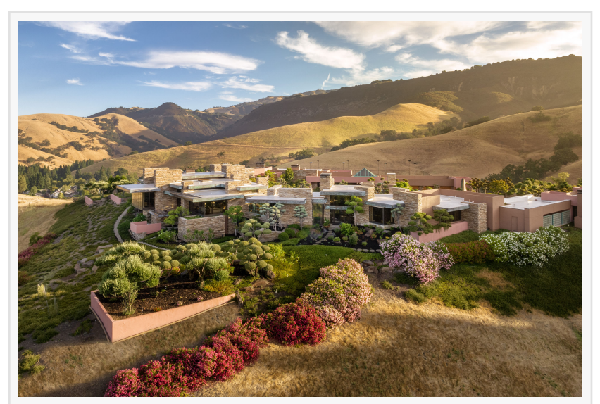
Visionary mid-century expression of the built environment in nature

Located at 81 Eagle Ridge Place, the custom-built estate occupies one of the