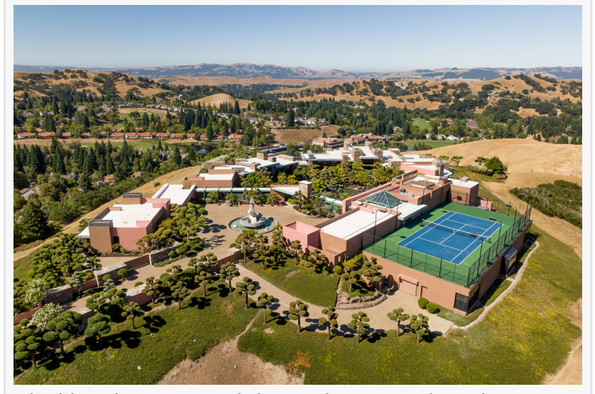
Blackhawk Country Club's exclusive Eagle Ridge