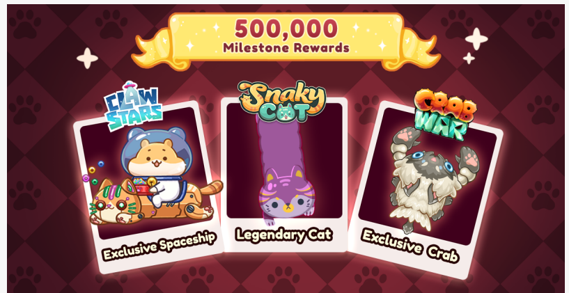
500,000 Pre-Registrations Milestone Rewards