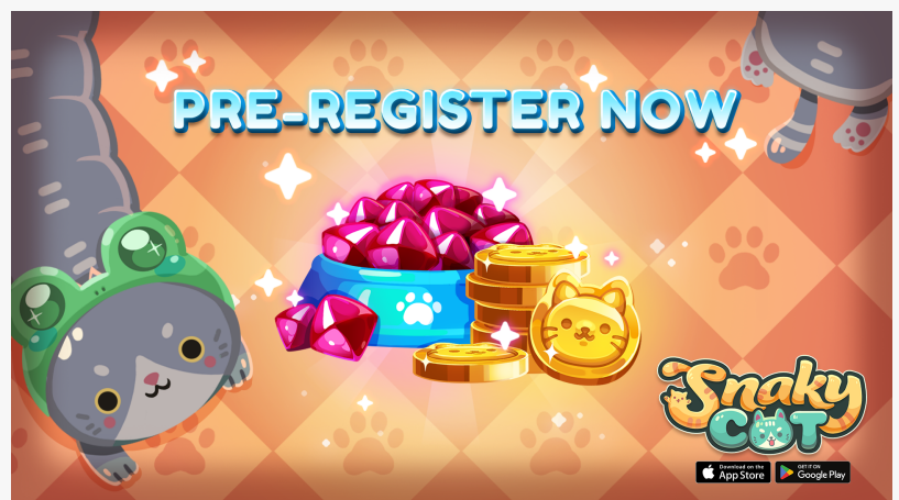
Pre-register now for Snaky Cat on Android or iOS!