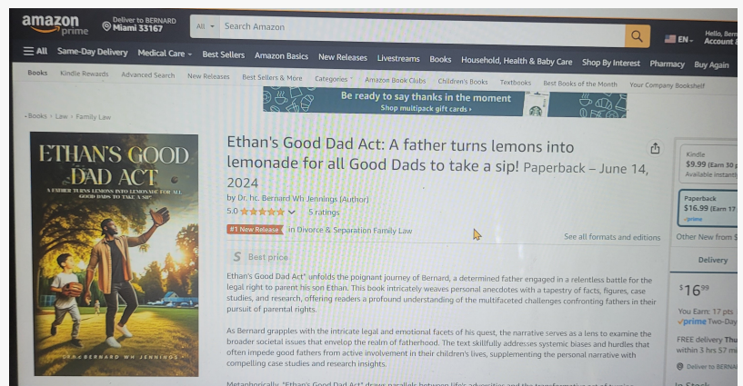
Amazon #1 Top Seller - Divorce and Family Law genre