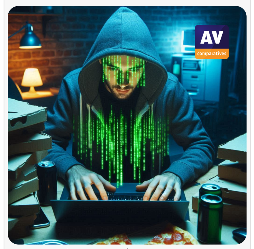
AV-Comparatives Approved Logo Enterprise Test - Icon

AV-Comparatives Approved Logo Enterprise Test - List